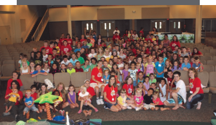
Vacation Bible School 2012 August 6-10, 2012